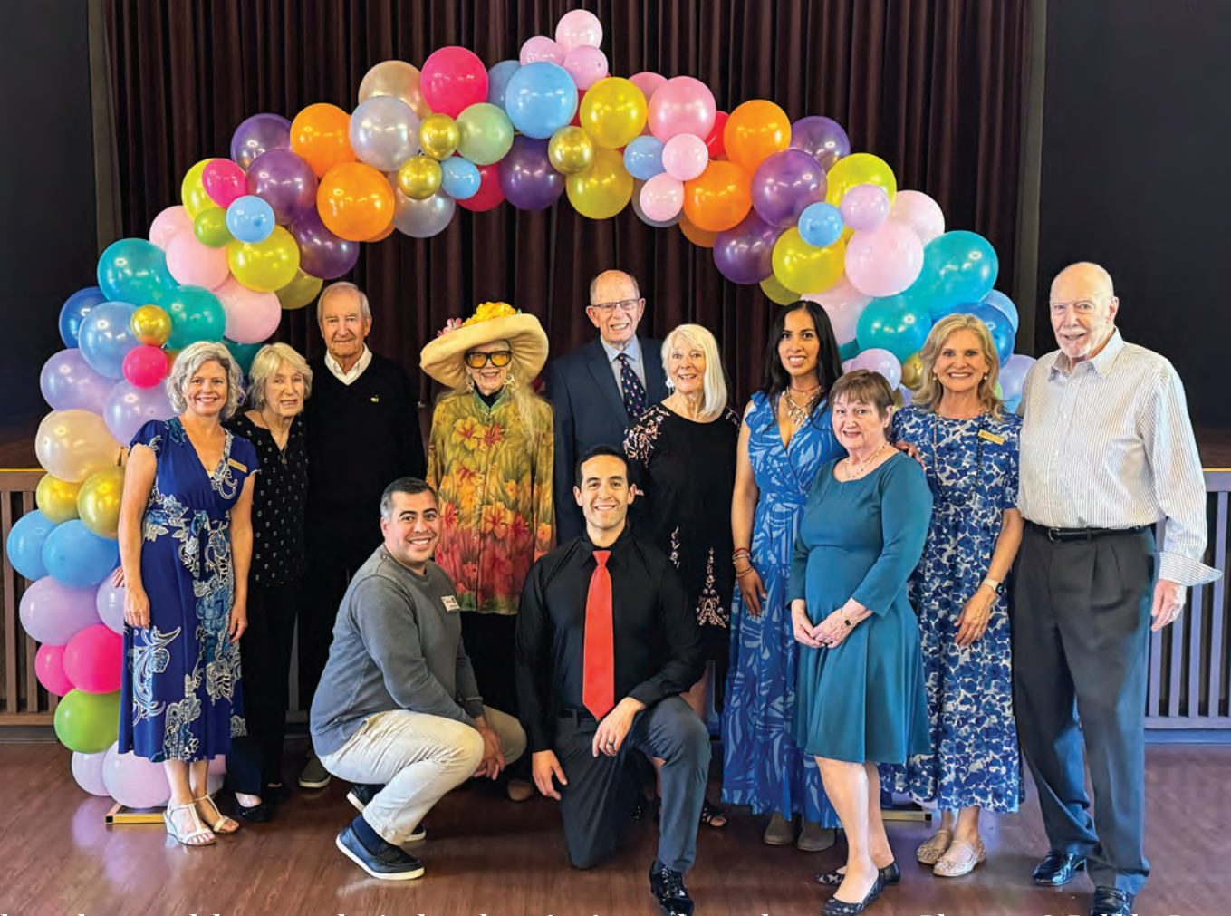
Residents showcased the moves they've been learning in our dance classes at our Blossoms & Bubbles Dance.