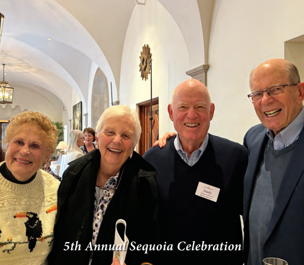
5th Annual Sequoia Celebration