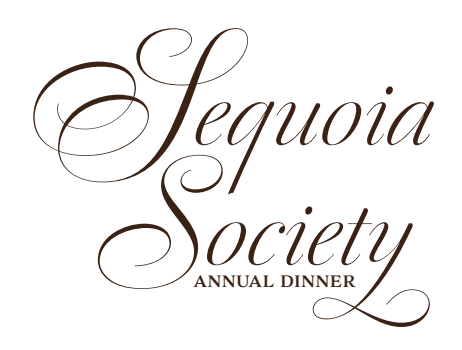
Our 2nd Annual Sequoia Society dinner honored and celebrated our current and past Sequoia Society members.